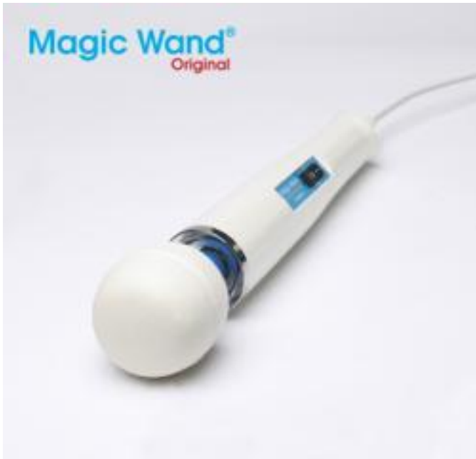
Figure 2. Hitachi Magic Wand

If you're both already comfortable with toys, and you're looking for something to add to her toy box, I recommend The Rabbit (Fig. 3). Again, this is a toy that has a lot of imitators, but I strongly suggest you purchase the Rabbit brand ( rabbitvibratortoy.com ). The picture here shows their original; however, they have since added a wide variety of options to choose from, each with some subtle differences.