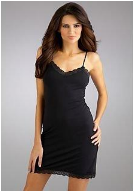
Figure 1: The Calvin Klein Lace Essentials Chemise S1324

Pay attention to which parts of her body she tends to conceal, and which she tends to show off, and buy something that highlights the part(s) of herself that she loves. For example, if she loves her chest and legs, but not her belly, don't buy lingerie in separates (a bra top and panties). Instead, buy something that is a once piece, like the aforementioned Calvin Klein example.