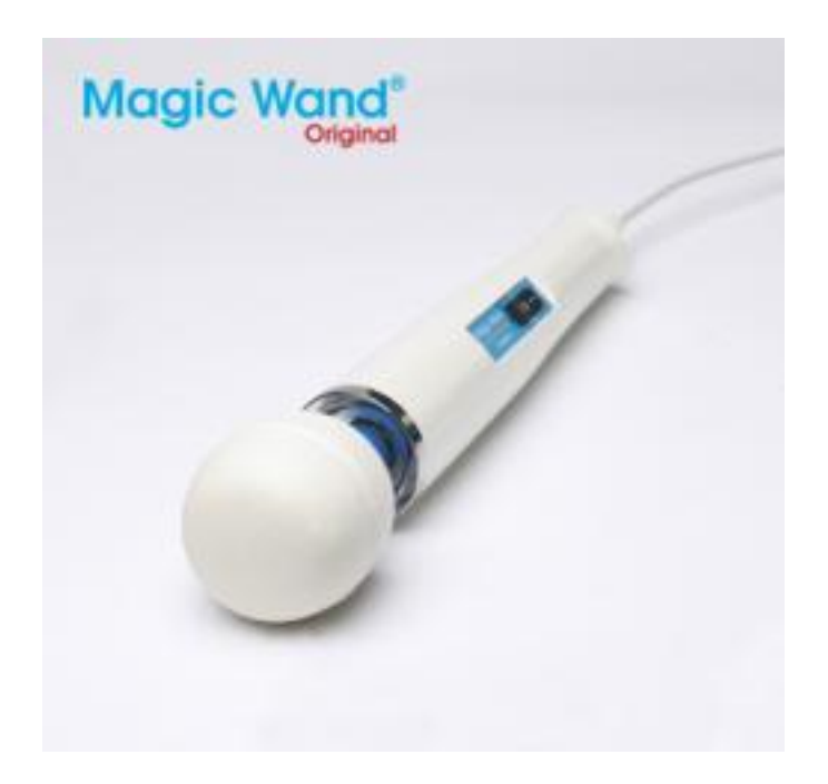
Figure 2. Hitachi Magic Wand

If you're both already comfortable with toys, and you're looking for something to add to her toy box, I recommend The Rabbit (Fig. 3). Again, this is a toy that has a lot of imitators, but I strongly suggest you purchase the Rabbit brand (rabbitvibratortoys.com). The picture here shows their original; however, they have since added a wide variety of options to choose from, each with some subtle differences.